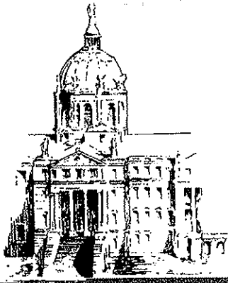
McLennan County Courthouse